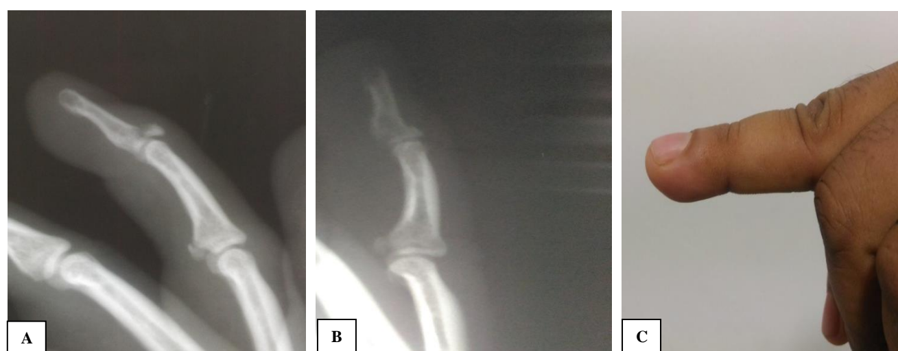
Figure 2: (A) Radiographs showing mallet fracture of the ring finger; (B) Postoperative radiograph showing anatomical reduction after wire removal; (C) Clinical photograph of full extension of the DIP joint at 3 months after follow up.