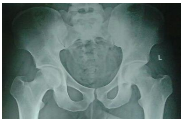
Figure 6: Post reduction 6 months check x-ray without any osteonecrotic changes of right femoral head.

On 6 months follow up patient came without any complaints of pain and with complete normal range of movements of right hip. X-ray was taken and assessed for any osteonecrotic changes which were absent (Figure 6).