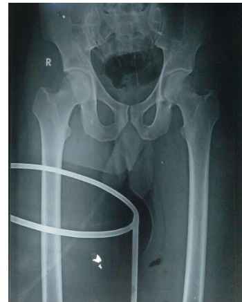
Figure 3: Post reduction x-ray of pelvis with both hips AP view with Thomas splint in situ.

After reduction with slight traction Thomas split was applied right lower limb and check x-ray of pelvis with both hips was taken and reduction was confirmed (Figure 3). Thomas splint was continued for 3 weeks.