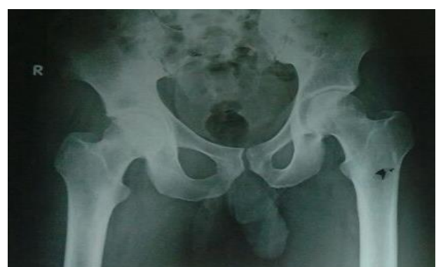
Figure 4: Post reduction 6 weeks x-ray of pelvis with both hips.

After vitals monitoring patient was shifted for x-ray of pelvis including both hip joints anteroposterior view. On x-ray patient was diagnosed as obturator type anterior right hip dislocation (Figure 2).