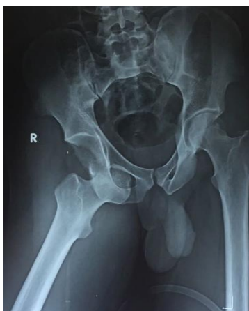
Figure 2: X-ray of pelvis with both hips anteroposterior view showing obturator (inferior) type anterior dislocation of right hip.

After vitals monitoring patient was shifted for x-ray of pelvis including both hip joints anteroposterior view. On x-ray patient was diagnosed as obturator type anterior right hip dislocation (Figure 2).