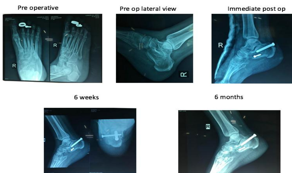
Figure 1: Surgical technique and radiological evaluation during follow up.

All surgeries were performed with Patients placed in the lateral decubitus position and under spinal anaesthesia and c-arm guidance. Firstly, Steinman pin is inserted in posterior inferior portion of calcaneus. Then In axial view varus, valgus angulation is corrected and provisionally fixed with Kirschner wires. In lateral view joint depression is elevated using bone taps and fixed with Kirschner wires. In tongue depression fractures Kirschner wire is inserted lateral to Achilles tendon and elevated. All provisionally fixed Kirschner wires are replaced with cannulated cancellous screws (Figure 1).