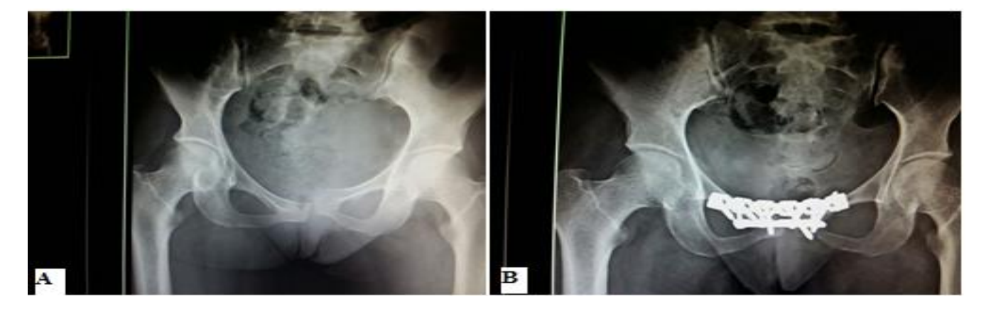
Figure 2: X-ray of pelvis of a 22-year-old female. A- Preoperatively, B- Postoperatively.