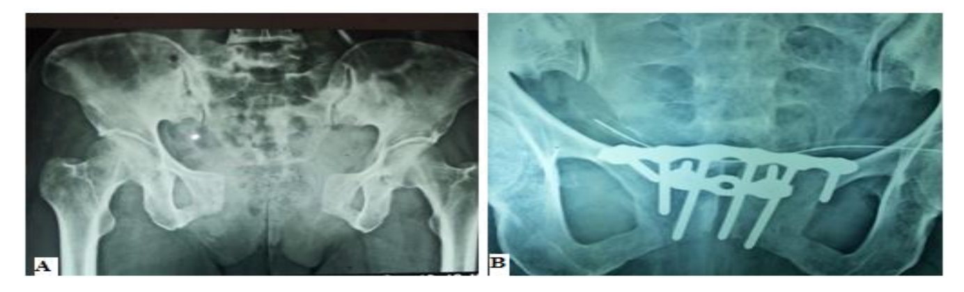
Figure 3: X-ray of pelvis of a 40 years old female. A- Preoperatively, B- Postoperatively.

Radiographical image of patients at preoperative and 6 weeks postoperative period is shown in Figure 2 and 3.