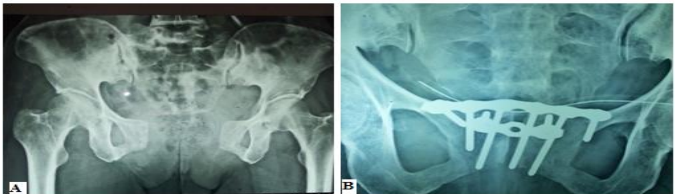
Figure 3: X-ray of pelvis of a 40 years old female. A- Preoperatively, B- Postoperatively.

Radiographical image of patients at preoperative and 6 weeks postoperative period is shown in Figure 2 and 3.