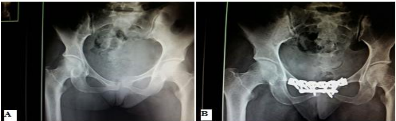
Figure 2: X-ray of pelvis of a 22-year-old female. A- Preoperatively, B- Postoperatively.

*statistical significant as P value less than 0.05.