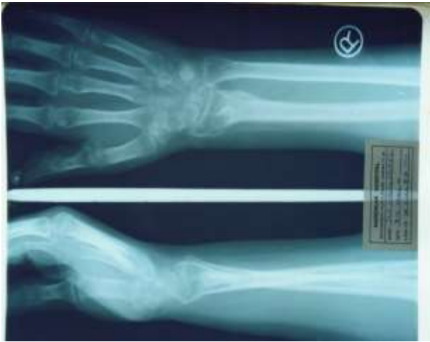
Figure 5: Final X-ray (union).