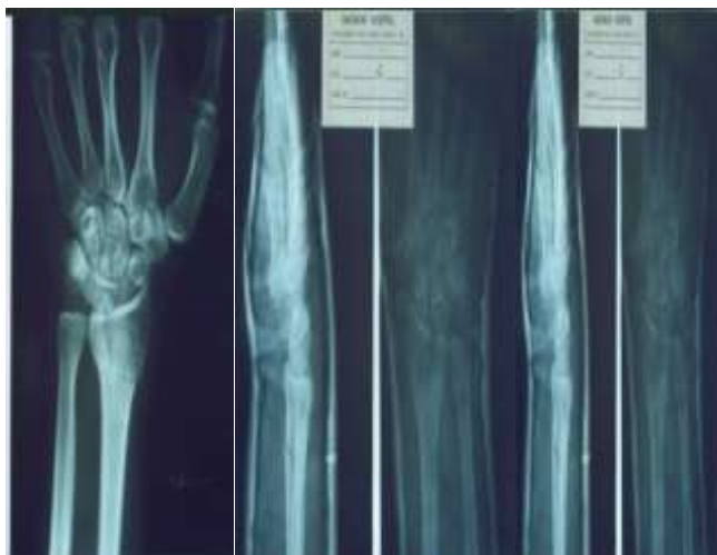
Figure 1: Undisplaced intra articular fracture treated with in-situ cast.

Table 8 shows the relation present between the early functional end results and anatomical end results. We should aim for good anatomical reduction to get good functional results in these fractures. In one case, we had achieved excellent functional end result despite of poor anatomical end result.