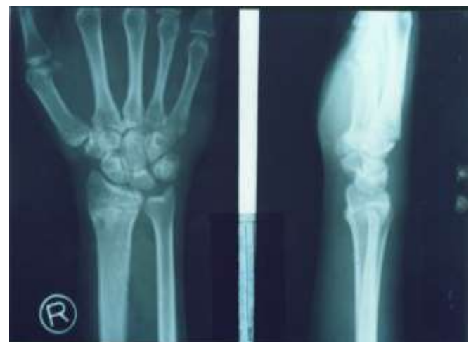
Figure3: Final X-ray-excellent anatomical union.