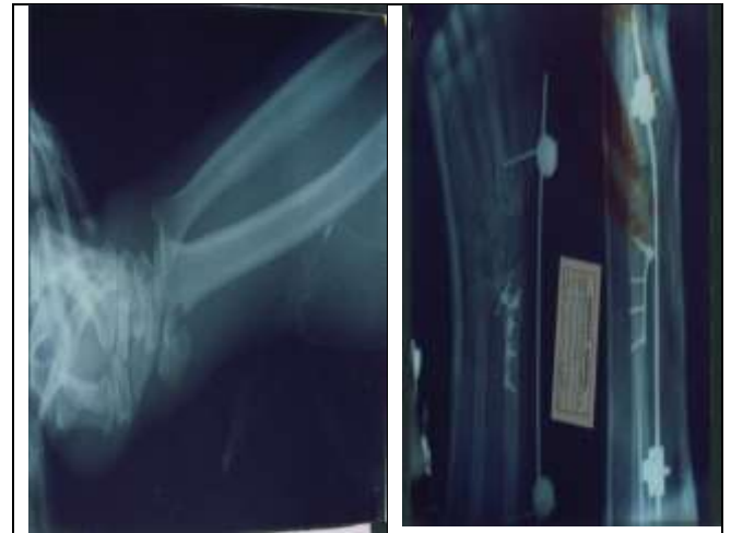
Figure 8: Unstable intra articular fracture treated with plating and Ex-Fix.