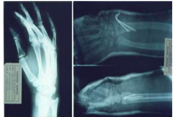
Figure 2: Intra-articular fracture treated with K-wires and cast.