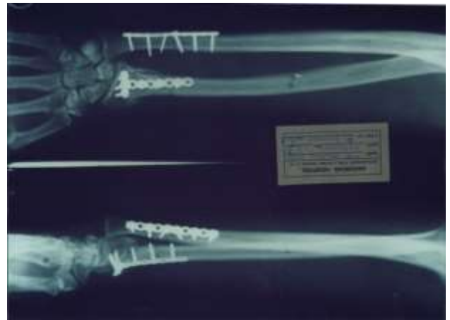
Figure 7: Final X ray -union in good position.