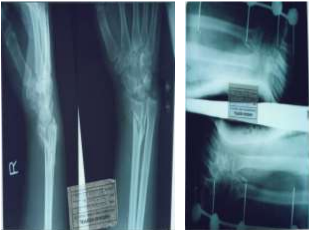
Figure 4: Unstable comminuted fracture treated with Ex-fix and cast.