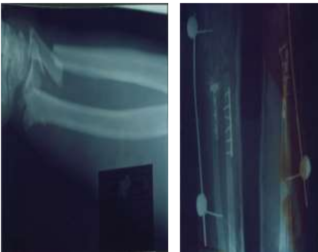
Figure 6: Comminuted fracture treated with plating and Ex-fix.