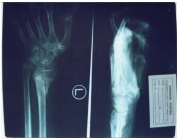
Figure 12: Complications (malunion).