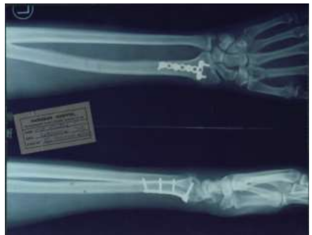
Figure 9: Final X-ray (union in good position).