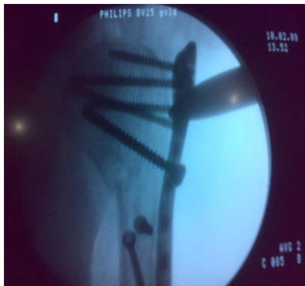
Figure 4: Postoperative X-ray image.

weeks of surgery and active exercises after 6 weeks of surgery under the guidance of a physiotherapist.