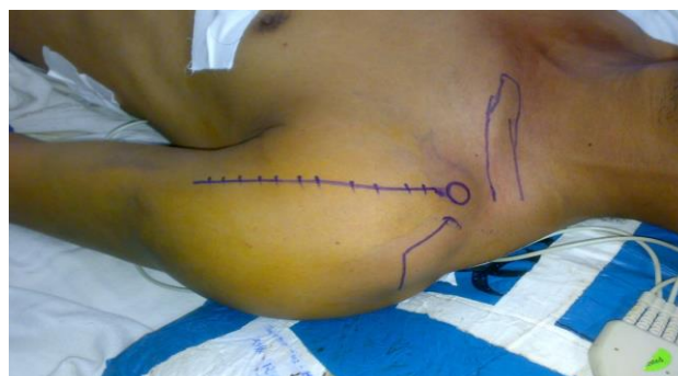
Figure 2: Marking of the delto-pectoral incision used for the proximal humeral locking system plate insertion.