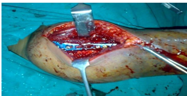
Figure 3: Insertion of proximal humerus locking plate with screws at the exact position needed.

The number and position of screws is dependent on the bone quality and the fracture configuration. In good bone stock 4–6 screws are sufficient, whereas in poor bone stock multiple fixation points using all screws is recommended. If inferomedial support is missing a slight impaction combined with an oblique-locked screw seems to achieve more stable medial column support and allow for better maintenance of reduction. Accurate measurement of screw length in osteopenic bone is difficult to obtain using a drill or a K-wire as a measuring device. Direct measuring with the depth gauge, after drilling the lateral cortex prevents penetrating the joint cartilage. The tips of the screws should stay 3–5 mm below the joint line. Too long screws with primary screw perforation during operation are one the major complications reported in the first series, which can be prevented following these precautionary measures. The plate is then fixed to the shaft. For this fixation head-locking screws or cortical screws can be used depending on the bone quality and according to the preference of the surgeon. The tension bands are then tightened to prevent secondary fragment displacement of broken tubercula during the early rehabilitation.