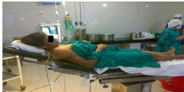
Figure 1: Positioning of the patient.

instrument between capsule and sub scapularis muscle then incise capsule to enter into joint.