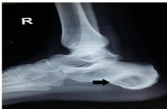
Figure 1: Lateral view radiograph of ankle before starting the treatment. Black arrow in the image showing a well-defined pure osseous lytic lesion in the body of calcaneum.