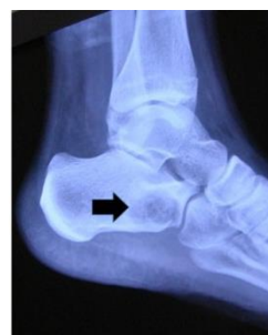
Figure 4: Lateral view radiograph of ankle showing the involvement of anterior process of the calcaneum, as shown by the arrow in image.

Radiographic imaging revealed involvement of body of calcaneus in 5 patients, tuberosity in 2 patients and 2 patients had involvement of anterior process (Figure 4). The demographic data, presenting symptoms, laboratory test results of all the patients were tabulated in Table 1.