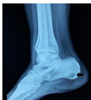
Figure 5: Lateral view radiograph of ankle of same patient as shown in Figure 1, after 9 months of ATT, showing the reminalisation and obliteration of cavity, as marked by black arrow.

Patients were able to resume full weight bearing ambulation after a mean period of 12 weeks (8 weeks to 18 weeks). In the three patients with sinus, the sinuses healed in a mean period of 8 weeks (4 weeks to 12 weeks). ESR showed a declining trend in all patients after initiating anti tubercular therapy. It returned within normal range after a mean period of 6 months (range 4 - 12 months).