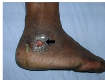
Figure 3: Clinical photograph of foot and ankle of a patient. Black arrow showing a discharging sinus over the lateral aspect of heel.

The presenting symptoms in all the patients were pain and swelling around the heel, along with the ‘heel up’ sign. In addition, three patients had discharging sinuses (Figure 3). History of fever, loss of appetite and weight loss was present in the two female patients only. History of trauma to the heel was given by three patients. Inguinal lymphadenopathy was found in five patients. Delay between onset of symptoms and definitive diagnosis ranged from 1 month to 14 months. Past history of tuberculosis was present in one patient. All patients were found to be immunocompetent. ESR was raised in all patients at time of diagnosis (mean 57; range 46 – 74 mm in first hour).