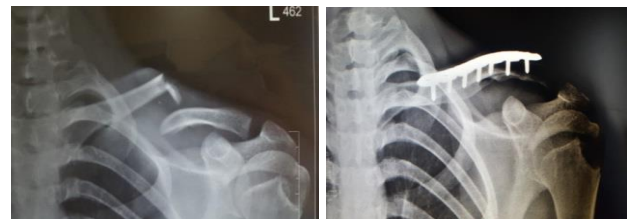
Figure 1: Pre-operative and post-operative x-rays.