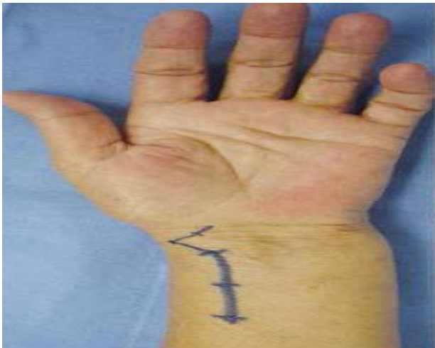
Figure 1: Standard Henry approach incision.

After the patients presented to the hospital, they were vitally stabilized and assessed for associated injuries or systemic comorbidities. Anteroposterior and lateral views radiographs were taken and classified as per AO classification. Due medical fitness was obtained and skin condition assessed before posting the patient for surgery. Patient was operated under block or general anaesthesia with fluoroscopy assistance.