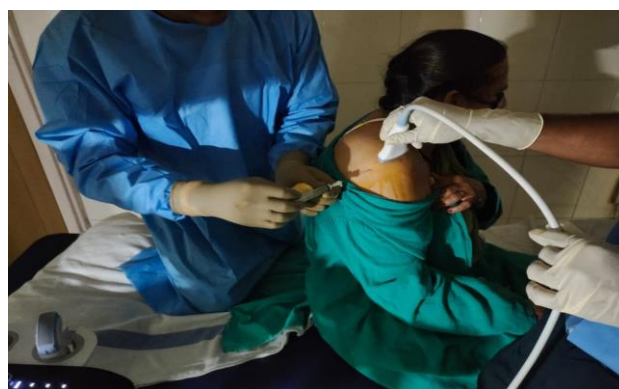
Figure 1: Dorsolateral approach (USG guided).

A two-member team consisting of one orthopedic surgeon and one interventional radiologist diagnosed and administered intervention in all cases to avoid confounding bias. After establishing the diagnosis clinico-radiologically, they explained the patients in detail about both the treatment modalities (PRP and corticosteroid) and possible side effects. Patients either received CS or received 2.5 ml PRP with local anaesthetic (2.5 ml of 2% lidocaine) was administered under USG guidance (Figure 1).