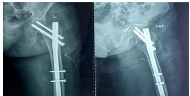
Figure 6: Post op X-ray of (case 3).