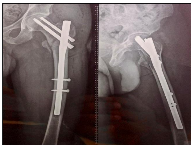
Figure 8: Post op X-ray of (case 4).