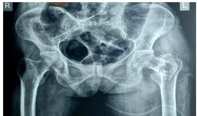
Figure 5: A 63 years old female (case 3).