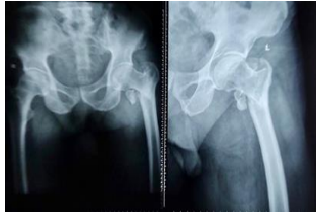
Figure 3: A 75 years old male (case 2).