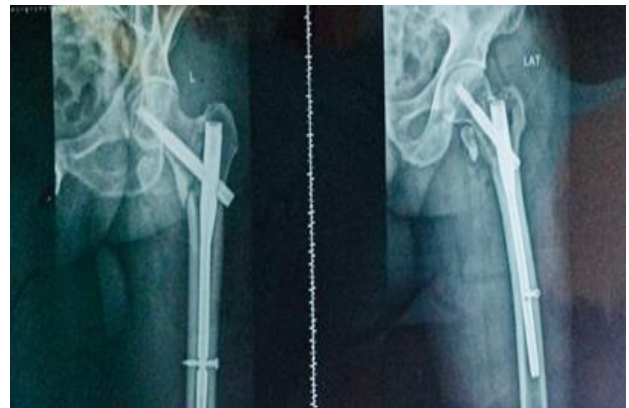
Figure 4: Post op X-ray of (case 2).