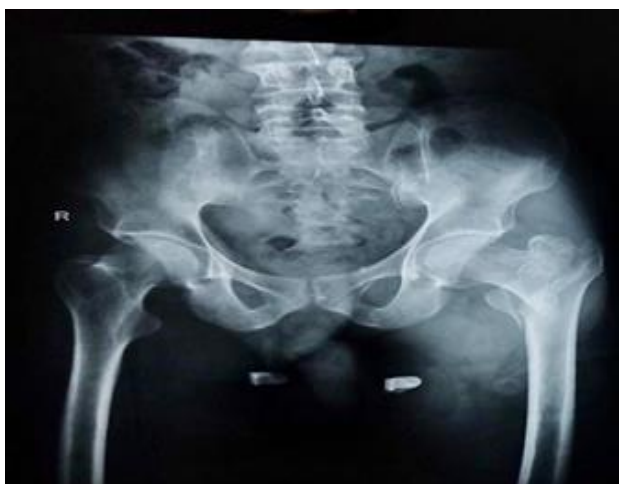
Figure 7: A 55 years old male (case 4).