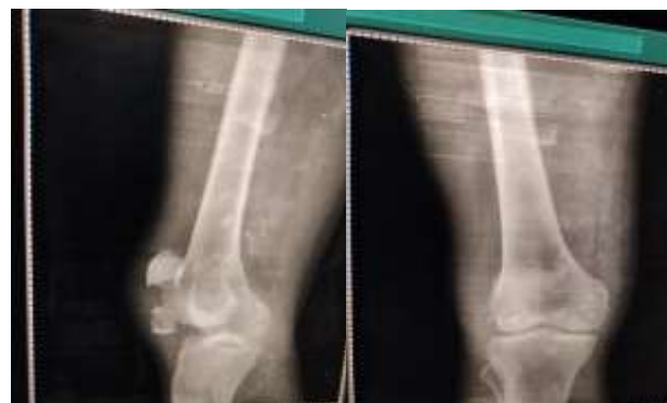
Figure 4: Pre-operative X-rays.