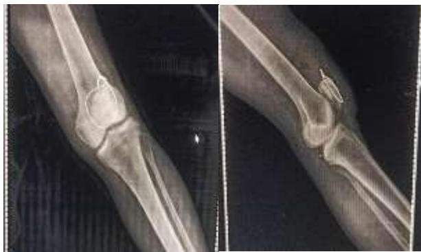
Figure 2: Postoperative X-ray encircage.