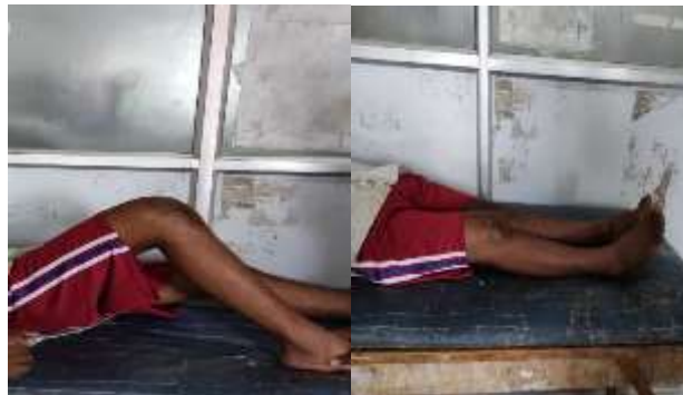
Figure 3: Postoperative range of movement.