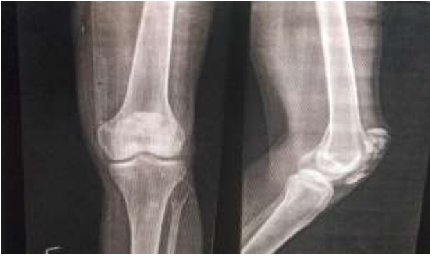
Figure 1: Preoperative X ray of comminuted patella fracture.