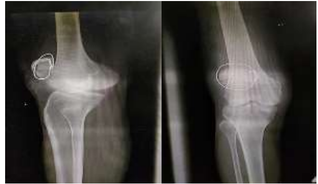
Figure 5: Postoperative X-ray with encircage.