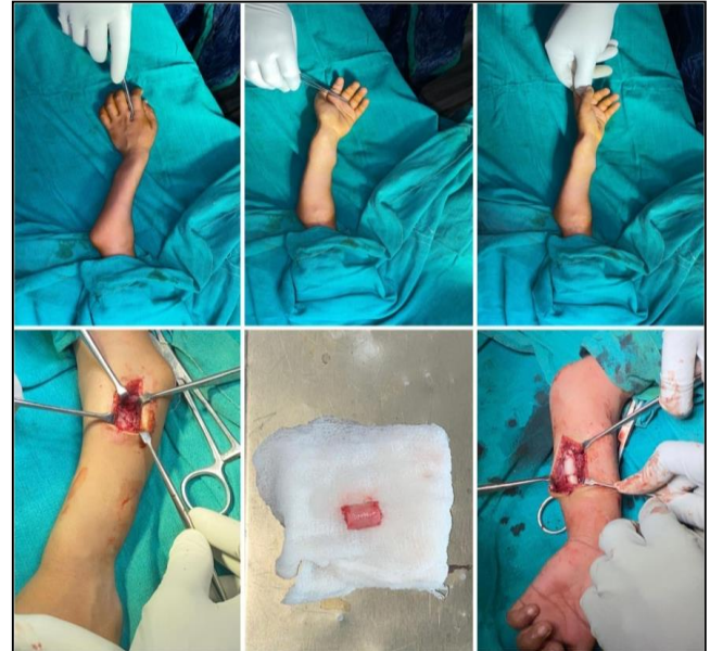
Figure 2: Intra-operative procedure: After calculating CORA, via Kocher's approach radius osteotomy done and about 2 cm of bone piece removed which was placed at ulna osteotomy site, periosteum was preserved to achieve adequate union at osteotomy site. Fixation was done using titanium intramedullary nail.

done using intramedullary titanium elastic nails. The exostosis on the distal ulna was curetted and sent for biopsy. Postoperatively the patient was kept immobilized for 6 weeks under the above elbow slab. Subsequent x-rays were done at 1, 6, and 18 months of follow-ups.