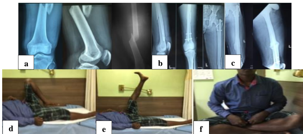
Figure 2: (a) Pre-operative X-ray showing diaphyseal comminution, (b) postoperative X-ray good reduction, (c) post op 3 months X-ray, (d) active hip and knee flexion post op 3 months, (e) active straight leg raising post-op 3 months, and (f) sitting crossed leg.