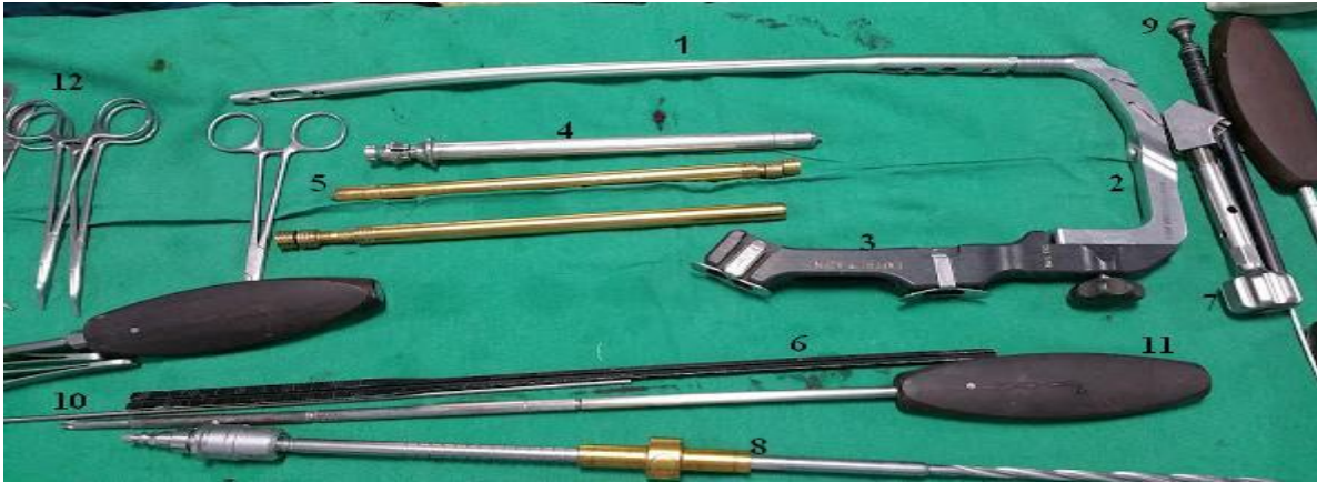
Figure 3: Instruments used for surgery - (1) intramedullary nail, (2) standard insertion handle, (3) aiming arm for Antegrade standard locking, (4) protection and drill sleeve with trocar, (5) locking sleeves, (6) direct measuring device, (7) insertion handle, (8) drill for cervical hip screw, (9) depth gauge, (10) drill bit, (11) star drive screw driver, and (12) artery forceps.