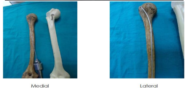
Figure 3: Trajectory mapping of J nail.

At final follow up, all patients were evaluated clinically with constant score, which includes pain (0-15), activity of daily living (0-20), range of motion (0-40), strength (0-25). 6 The shoulder function was tested with a goniometer and the muscle power with a spring balance as described by Constant et al. 6