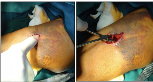
Figure 1: Incision and entry point 1 inch on lateral side of upper arm, just below distal end of deltoid muscle insertion approximately 1.5 cm long incision.

All patients were taken under regional block anesthesia, in supine on radiolucent table. J nails were made up of 2 mm and 12 inches Lambrinudi wires (blunt tip Kirschner wires). 2.5 to 3 cm incision at mid arm anterolateral aspect were taken just distal to deltoid insertion. 3 or 4 J nails were used in each case (Figure 1).