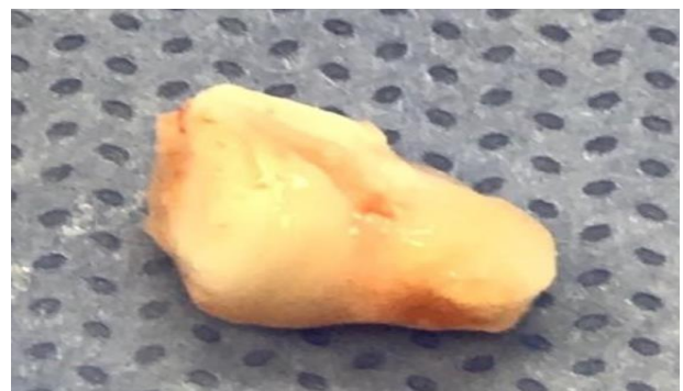
Figure 4: Excised, triangular in shape, accessory medial cuneiform bone.