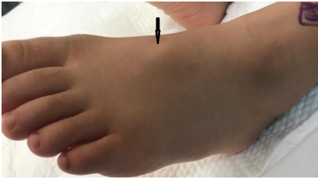
Figure 1: A pre-operative photo of the foot of a bony prominence at the site of pain.

and suggested an accessory bone fused with the mother bone (Figure 2).