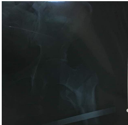
Figure 2: Radiograph of a 64 years old female with AO/OTA type A2.3 fixed with DHS of pre-op.