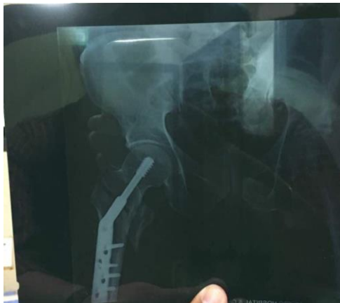
Figure 3: Radiograph of a 64 years old female with AO/OTA type A2.3 fixed with DHS of immediate post-op.