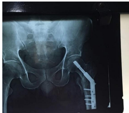
Figure 4: Radiograph of a 64 years old female with AO/OTA type A2.3 fixed with DHS of X-ray 6 months post-op.