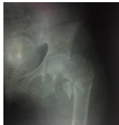
Figure 5: Radiological status of 72 years old female of type AO/OTA A3.3, fixed with PFN of pre-op.