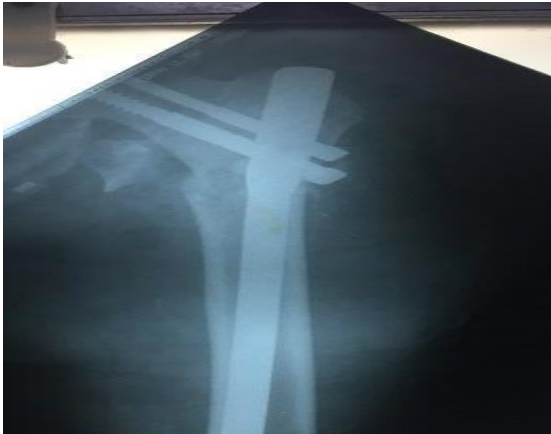
Figure 6: Radiological status of 72 years old female of type AO/OTA A3.3, fixed with PFN of immediate post-op.