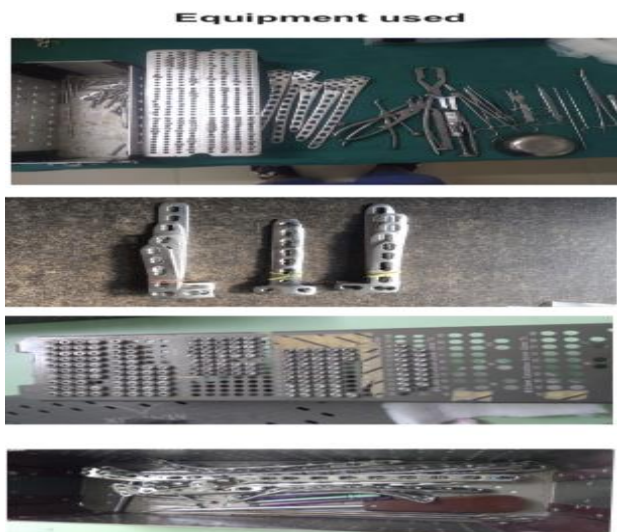
Figure 1: Equipment used.

5 patients of each distal femur fracture and proximal tibia fracture had fever with wound infection. These patients were treated by daily dressing and intravenous antibiotics. All 10 cases of wound infection were open grade 3B on admission.