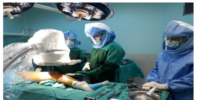
Figure 2: Retrograde femur nail application in a distal femur fracture case, using PPE.