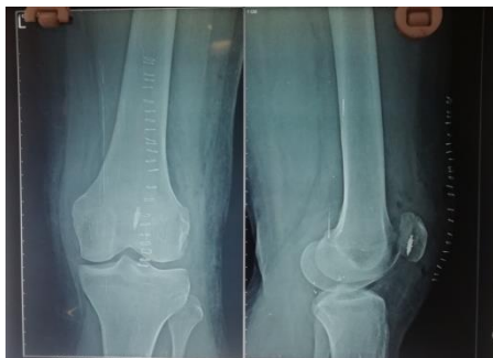
Figure 3: Post operative X-ray with suture anchor.