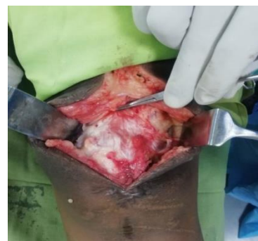
Figure1: Ruptured quadriceps tendon.

the superior border of the patella was found to be degenerated and had a palpable gap (Figure 1). The unhealthy tendon is excised and using suture anchors, the tendon is attached to the posterior surface of the patella and the extensor mechanism was restored (Figure 2-3). 1,2 Patient was immobilized using a knee brace and patient was able to do straight leg raising with knee brace in the immediate postoperative period. Patient was immobilized during the postoperative period. Later physiotherapy was initiated and patient was able to extend the knee fully now.