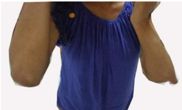
Figure 2: Range of motion at the elbow is not restricted.

Radiological imaging revealed a deformed misshapen ulna with absence of its distal end, ulnar deviation of hand and radial bowing. Radial head was subluxated and proximally migrated (Figure 3).