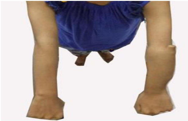
Figure 1: Forearm is shortened on the left and radial head is grossly subluxated.

decreased wrist flexion. There was no associated hand anomaly.