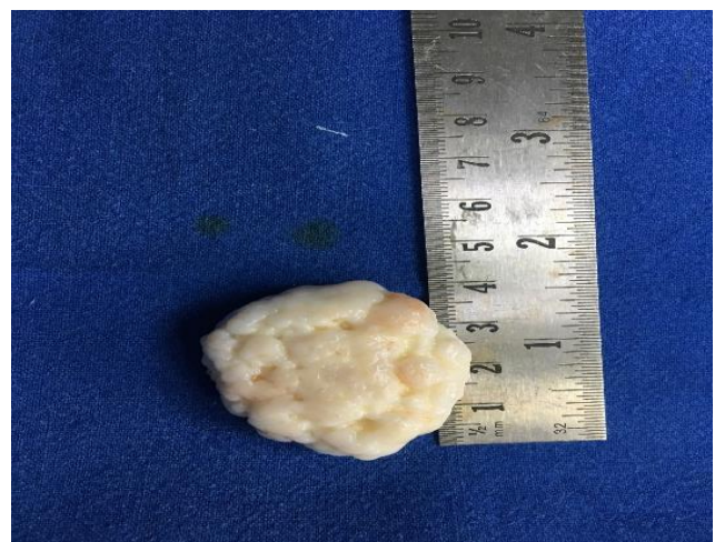
Figure 3: Gross appearance is that of a multilobulated synovium with multiple white or bluish nodules that are composed of hyaline cartilage attached to the synovium of varying size.