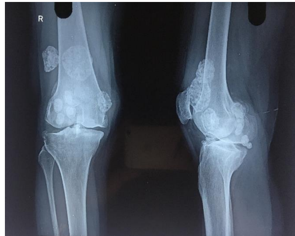
Figure 1: Antero-posterior, lateral x-ray of right knee showing multiple loose bodies.

Figure 4 shows microscopically, the metaplastic synovium shows cartilaginous nodules beneath the surface lining of the synovial membrane. They may be highly cellular and of moderate pleomorphism. The nodules are variably cellular with the chondrocytes seen in clusters, a very characteristic finding.