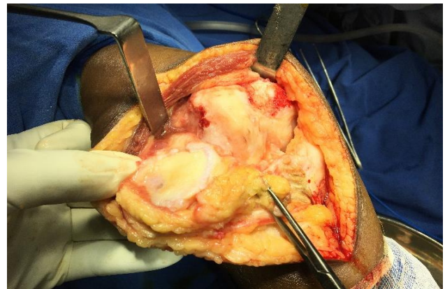
Figure 2: Intraoperative image showing hypertrophied synovium and eroded joint surface.