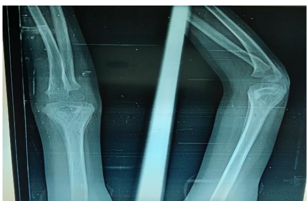
Figure 4: Post op month 3 X-ray.