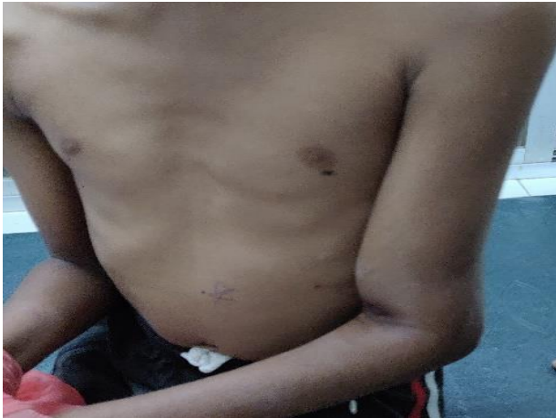
Figure 1: Initial presentation.

fractures needing debridement and irrigation, and fractures associated with vascular injuries. Open reduction must be done carefully to avoid complications like cubitus varus or valgus deformities, myositis ossificans, elbow stiffness, neurovascular complications like brachial artery or ulnar nerve injury and compartment syndrome. 15,16 The aim of this study was to judge the results of open reduction and internal fixation after failed close reduction in Gartland type III SF in our circumstances.