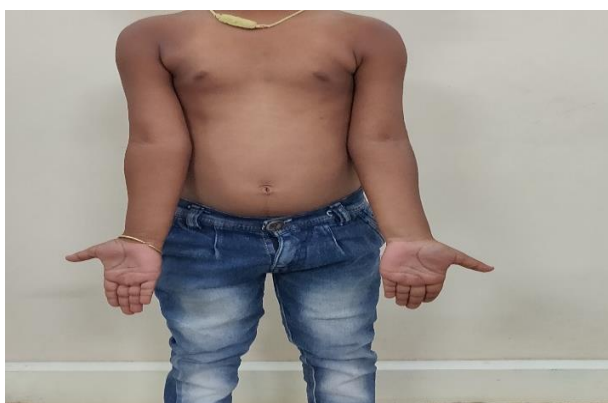
Figure 5: Post op month 3 clinical picture.