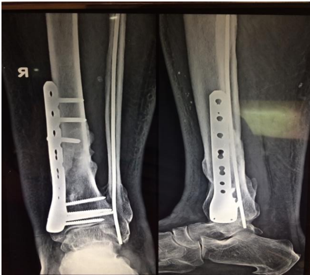
Figure 8: X-ray taken at 6 months follow-up for bony union.

of a heavy object (two patients-5%). None of these patients required any other surgical intervention apart from the intervention for tibia fracture. Most of the fractures were classified as AO Type-A1 (twenty-three patients), thirteen patients were classified under AO Type-A2, four patients were classified under AO Type-A3 (Figure 9). 8 Twenty-eight patients (70%) had an associated ipsilateral fibula fracture, 13 of which were treated with a closed reduction and intramedullary nail for the same. All patients were operated within one week of the injury and the mean time between trauma to surgery was 3 days.