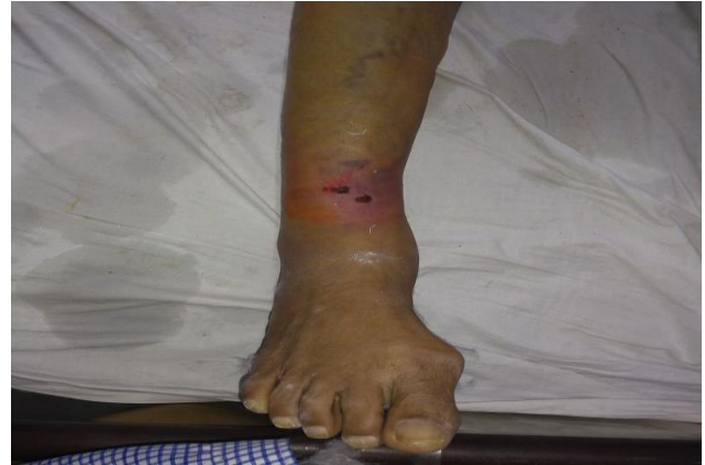
Figure 1: Pre-operative precarious soft tissue coverage (classified according to Oestern tscherne classification).

this paper. Post-operatively, the patients were put on physiotherapy exercises (knee and ankle range of motion exercises) gradually to prevent ankle and knee joint stiffness. The patients were discharged on postoperative day 3 after a post-operative X-ray (Figure 6). Suture removal was done two weeks after the surgery. After suture removal, the patients were allowed partial weight bearing with crutches for 6 weeks followed by gradual full weight bearing.