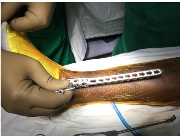
Figure 5: Plate pushed along epi-periosteal plane.