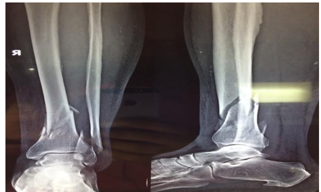
Figure 2: Pre-operative AP and lateral radiograph.