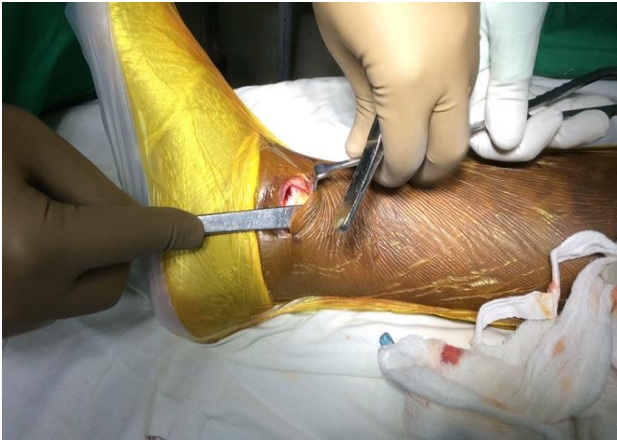
Figure 4: Subcutaneous epi-periosteal plane dissected using a periosteum elevator.