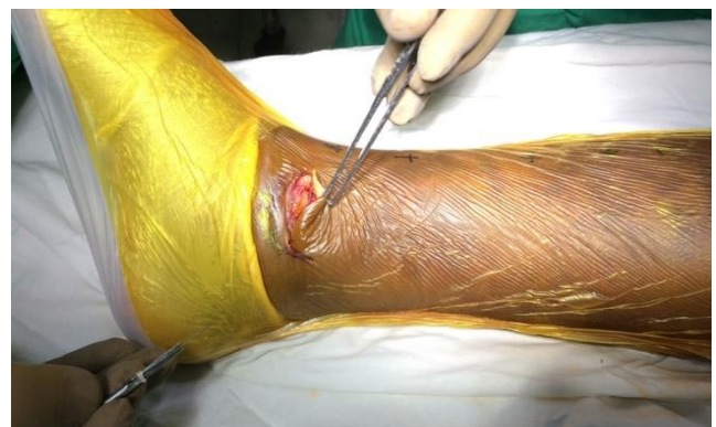
Figure 3: Intra-operative mini-incision taken over medial malleolus.