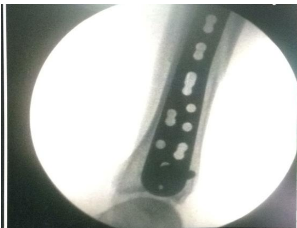
Figure 6: Intraoperative radiograph to confirming plate position and reduction.

Patients were followed up and X-rays were done at fourth week, eighth week, and twelfth week postoperatively or until bone union was achieved (whichever was earlier) (Figure 7). Thereafter, X-rays were repeated as and when required. The postoperative assessment was done for the