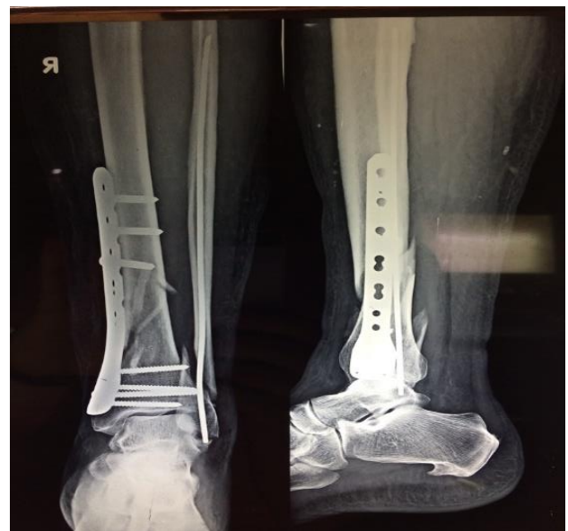
Figure 7: Immediate post-operative AP and lateral X-ray on day 3.

ankle range of motion, pain grading (-no pain, + occasional pain, ++ pain after walking a distance, +++ pain at rest), loss of motor power or weakness and incidence of complications. Functional results were assessed using the clinical rating system by Teeny and Wiss. 7 All the patients with a normal ankle function without interference in work, no pain or swelling, and a full range of motion were classified as 'excellent'. The patients with some swelling, but no or occasional pain, slight restriction of full flexion otherwise normal and no interference in day-to-day work were classified as 'good'; patients with pain after exercise, swelling, small restriction in range of motion at the ankle and hampering the patient in the day-to-day activities were classified as 'fair' and those with severely hampered day-to-day activities, pain at rest and severely restricted range of motion were classified as 'poor'. These results were compared with the results from other studies.