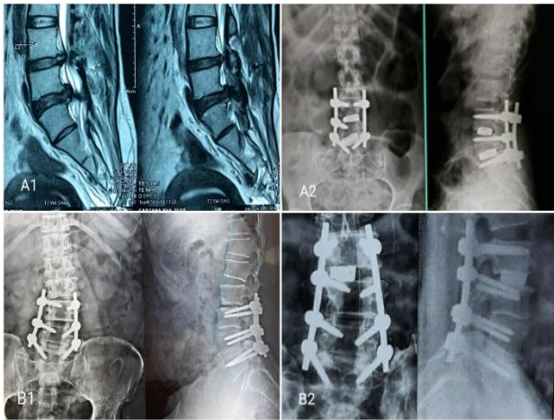
Figure 3: Complications of lumbar fusion. (A1 and A2) MRI of failed 2 level discectomy after 1 year managed with 2 level posterior interbody lumbar fusion revision surgery. (B1 and B2) 2 level instrumented fusion at L3-4-5 which developed adjacent segment degeneration (juxtafusion instability) at L2-3 level after 2 years managed with interbody fusion at that level.

Most of the surgeries done were one level disc fusion amounting for 32 out of 40 cases. As the number of disc spaces fused increased, the expected outcome attained after 2 years was less than ideal (Table 6).