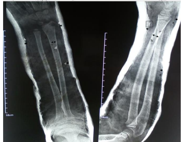
Figure 4: Calculating the three point index/

fractures and differs from the other indices because it not only takes into account the gaps at the fracture site, it also uses the gaps proximal and distal to the fracture sites, which are important points to maintain reduction against common displacement forces (Figure 4). 8