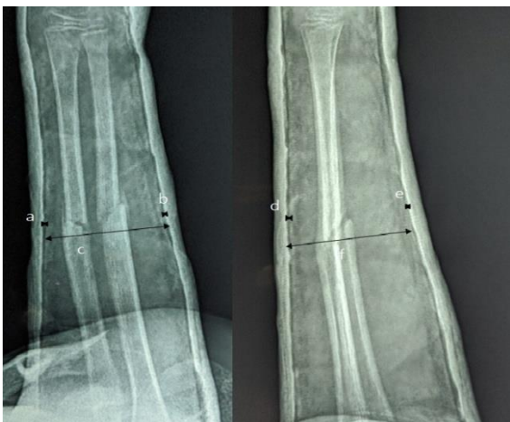
Figure 3: Calculating the gap index.

The Gap index is a recently defined radiographic measurement by Malviya et al based on ratios of the gaps in the cast at the level of the fracture to the entire inside width of the cast in two planes (Figure 3). 7