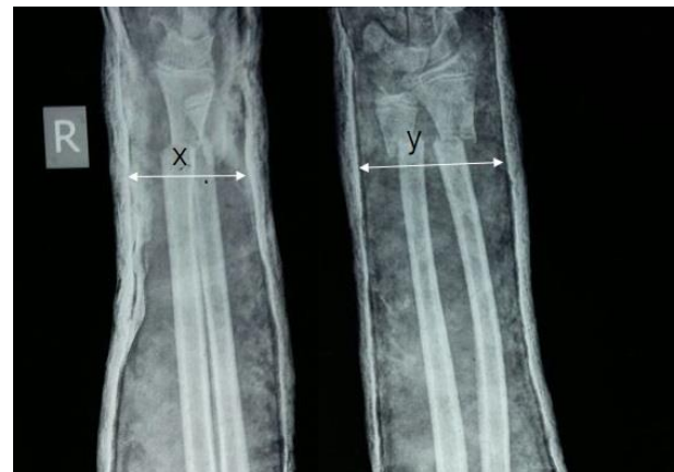
Figure 1: Calculating the cast index.

The cast index was proposed by Chess et al and is calculated on the basis of the cast geometry at the fracture site, such that Cast index = inner diameter of the cast at fracture site in lateral view/ inner diameter of the fracture cast at fracture site in AP view (Figure 1, Cast index = x/y ). 5