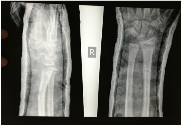
Figure 2: Calculating the padding index.