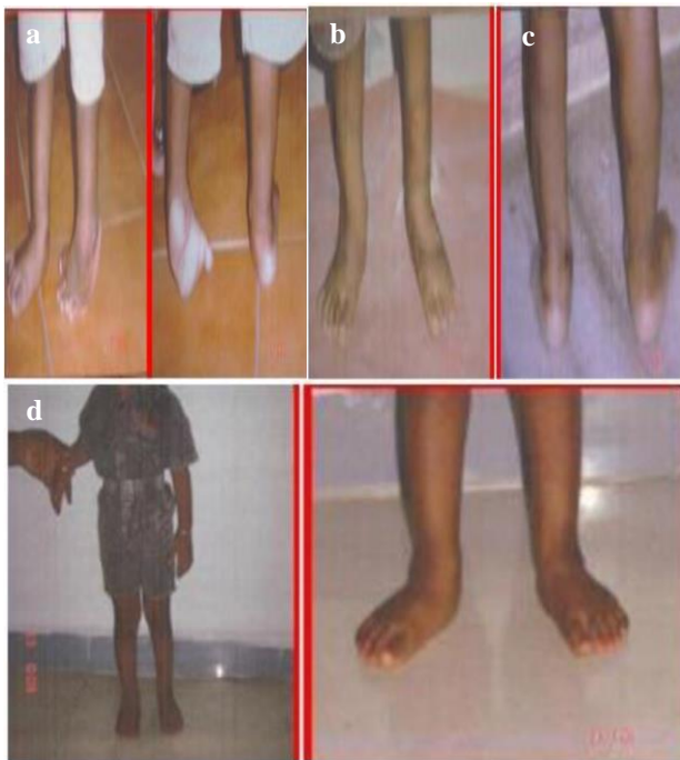
Figure 2: (a) Pre-operative, (b) 3 months follow-up, (c) 6 months follow-up and (d) 1 and half year's follow-up good correction.

The results of our study were good in 71%, fair in 19%, poor in 10%. Turco has a result of excellent and good in 86%, fair in 9% and poor in 5%. 8