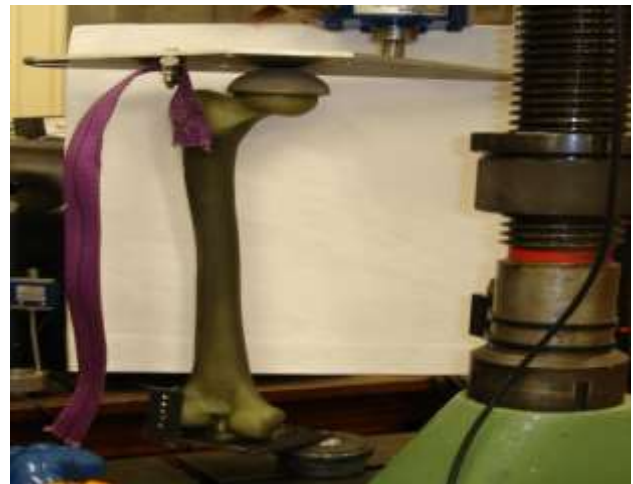
Figure 2: Photograph showing the mechanical testing of the Sawbone model using Dartec 9500 servo hydraulic machine.

the position and movement of each area on the surface. In dynamic failure situations, images are acquired at 225000 frames per second in a burst of 32 images for a polymer edge cracked beam subjected to impact loading. This enabled the stress intensity factor (SIF) to be followed over 140µs from the point of contact. The measurement field sizes are 10-100 mm 2 with accuracy for displacements of 0.01 pixels and accuracy of strain 200 µ strains. Strain distribution could then be calculated from the displacement gradients. The strain in the vertical direction was plotted as colour contours and the peak strains in regions of interest were extracted for further analysis.