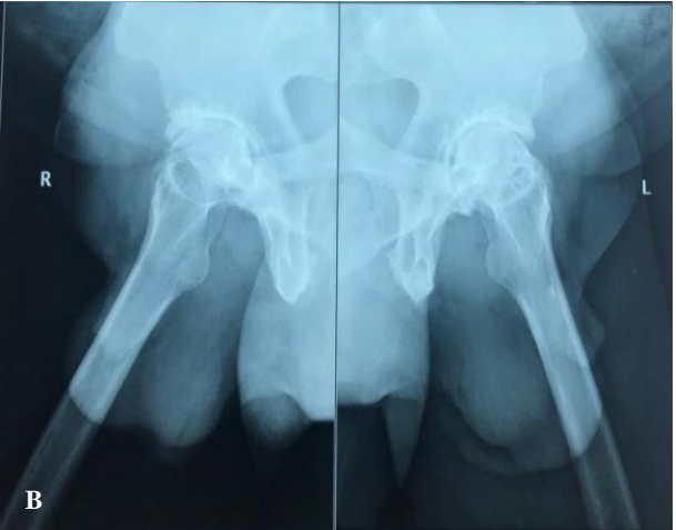
Figure 1 (A and B): Preoperative X-ray showing bilateral ankylosis of hip.