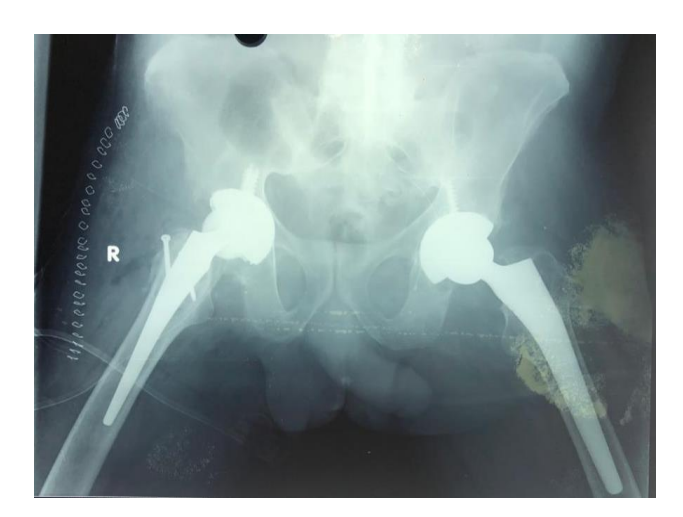
Figure 4: Intra operative greater trochanteric Vancouver's type A1 fracture was seen in a patient of ankylosing spondylitis which was treated with cancellous screw fixation.