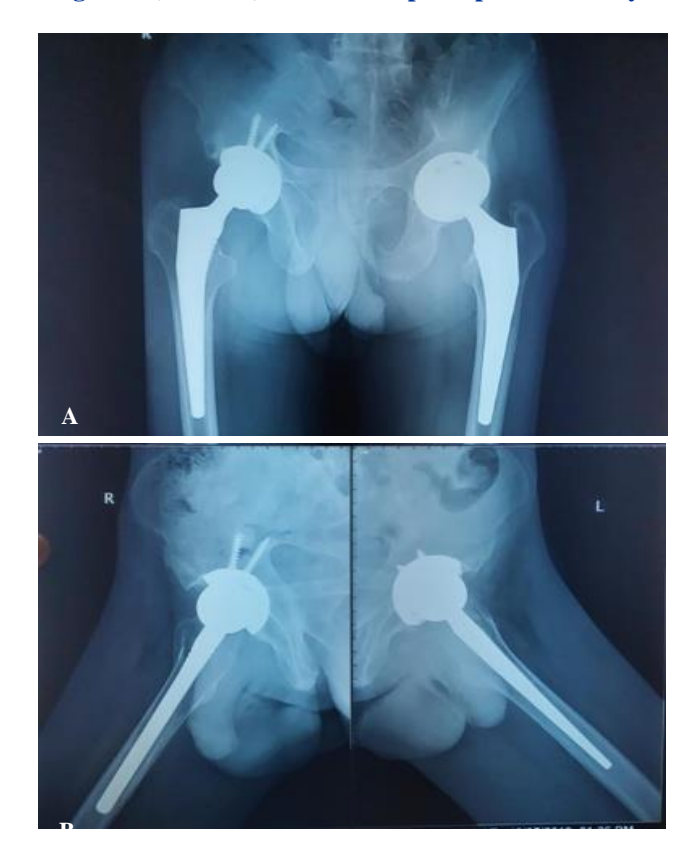
Figure 3 (A and B): Follow-up X-ray at 1 year.