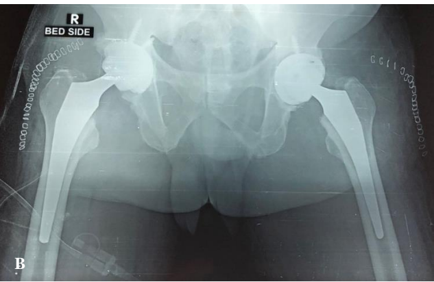
Figure 2 (A and B): Immediate post operative X-ray.