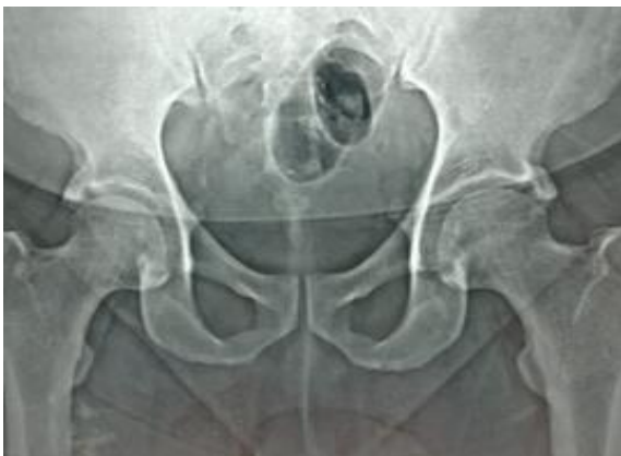
Figure 3: Post-operative picture I.