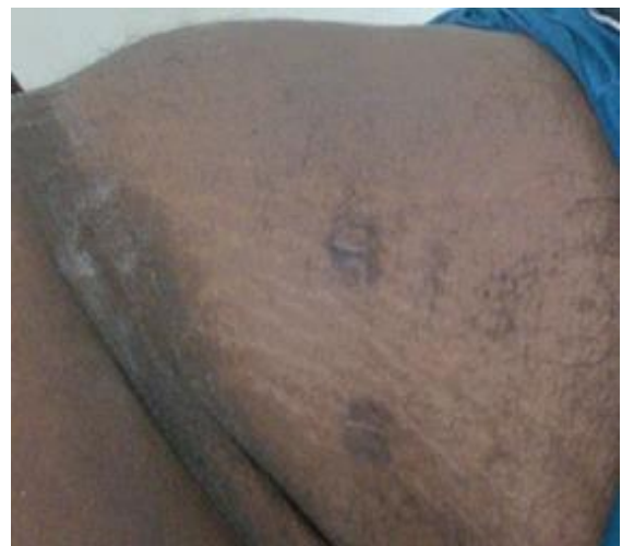
Figure 5: Healed scar.