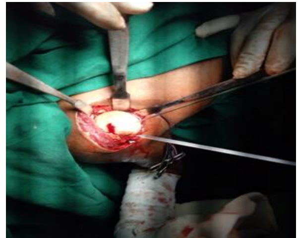
Figure 5: Bio-pin and fragment stabilized with K-wire.