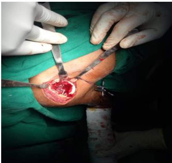
Figure 3: Osteochondral defect.