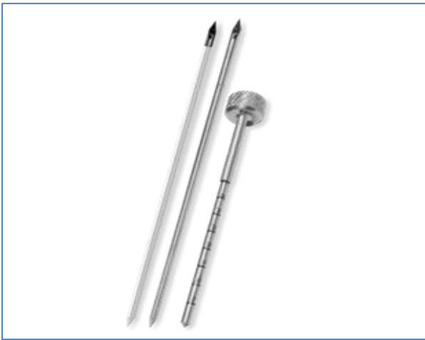
Figure 2: Arthrex bio-pin.