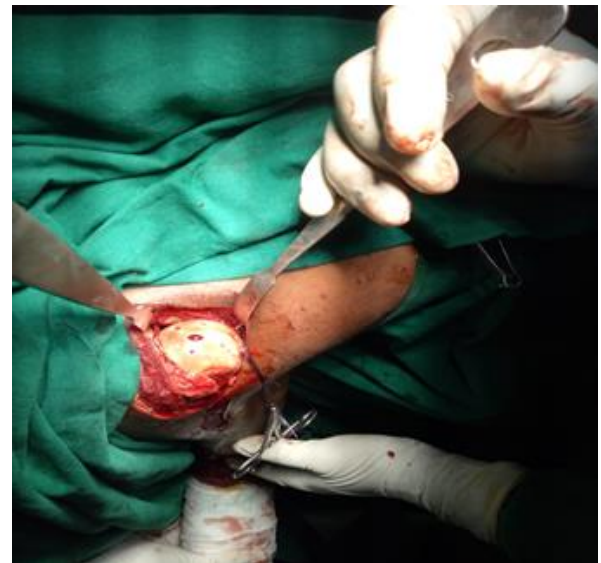
Figure 6: Fragment fixed with bio-pins.