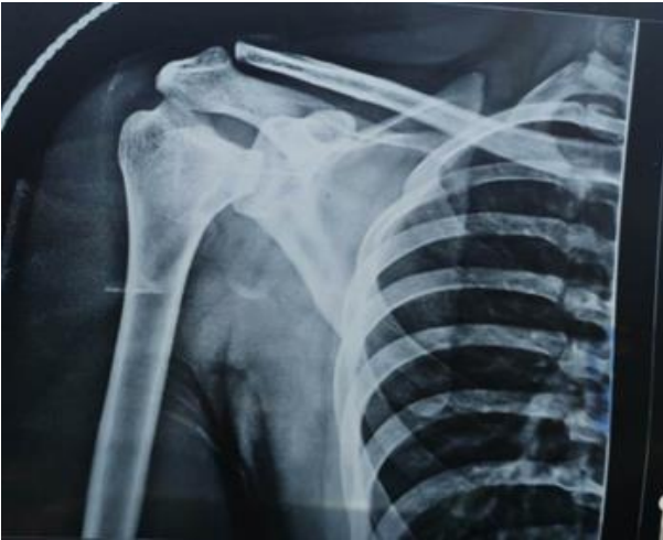
Figure 1: X-ray showing defect in humeral head.