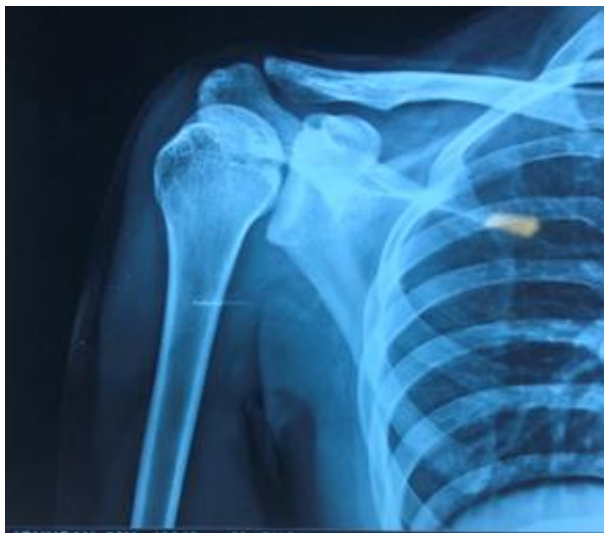
Figure 8: Six weeks post-op.

The subscapularis tendon was anatomically repaired. Postoperatively arm sling was given. Elbow and wrist movements started from day 1. Patient was discharged on 3rd postoperative day. Range of movement exercise was advice from 4th week.