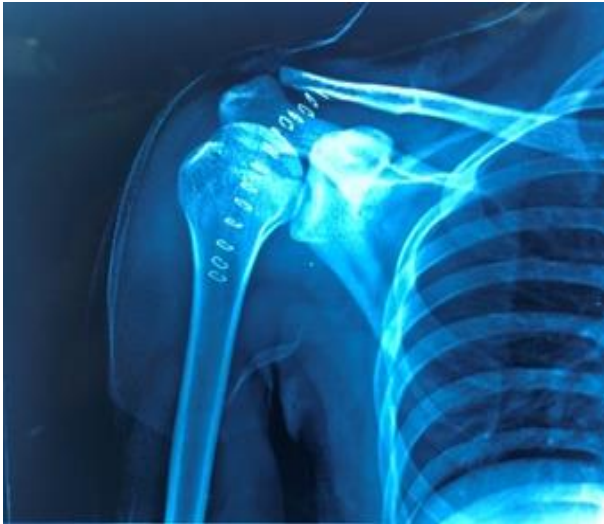
Figure 7: Immediate post-op.