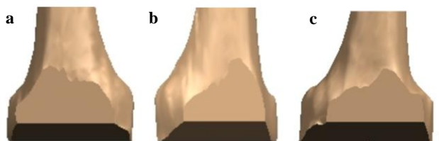
Figure 2 (a-c): Image cuts with higher disagreement on classification that must be classified like 1 (b).

native groove line (Figure 3). 11 As showed in the image, 6° of external rotation corresponds to type 1b, 6° of internal rotation corresponds to type 2b, and original cut corresponds to type 2(a).