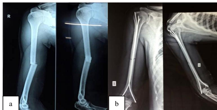
Figure 3: (a) Preoperative radiographs and (b) postoperative radiograph.