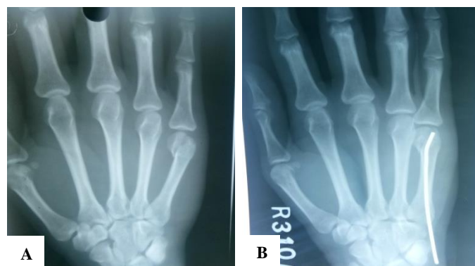
Figure 2: (A) Preoperative radiograph showing the angulation of the neck of the fifth metacarpal; (B) the angle being corrected by the bent k-wire introduced in antegrade manner.